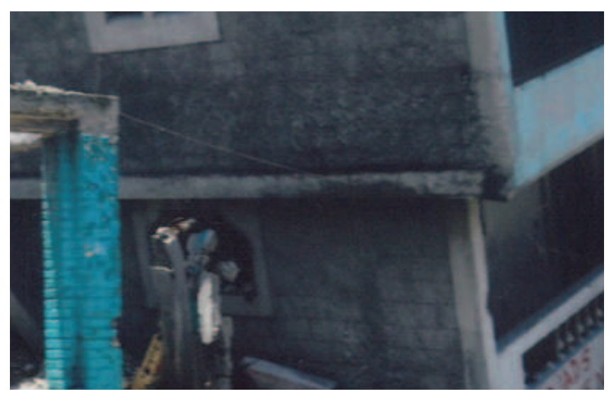
3-story house collapsed in the January earthquake

A second trip took Bob to the Ukraine to teach Post Frame Construction. They traditionally construct buildings out of 200-lb blocks that must be lifted into place by crane. Large buildings cost millions of dollars and take years to build. A large pole barn can be built for $12,000 and completed in 2-3 weeks. Borkholder Buildings in Napanee, IN, supplied 3 building kits. The Ukraine contractors watched in amazement as the buildings went up, seemingly overnight. A newspaper proclaimed post buildings that we have been using for 200 years as "New Technology from America." "The Ukraine volunteers built