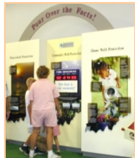
State Fair Exhibit 2000. Farm*A*Syst & Home*A*Syst portion is at the far right.

Farm*A*Syst and Home*A*Syst were promoted using displays 17 events. Our exhibits included a table top display promoting Farmstead Assessment, brochures, Farmstead Assessment materials, Home*A*Syst guides, a lap-top computer with our Web site available