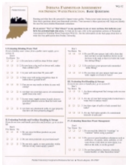
New “Basic Questions” Worksheet